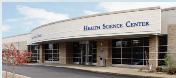
NORTHWEST CAMPUS • HEALTH SCIENCE CENTER 8200 W. Outer Drive, Detroit, MI 48219 313-943-4010