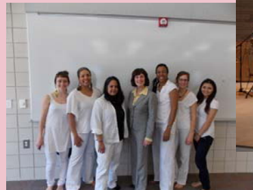
Zili Misik: Multi-ethnic all female band