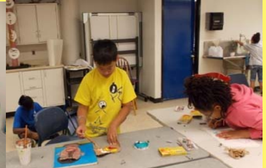
~3-D Art Camp~ Math Madness and Geometrical Properties and Applications~ ~Young Writers Camp~ Grammar Blast Camp~