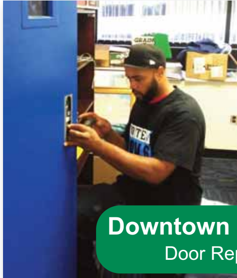
Downtown Campus Door Repairs