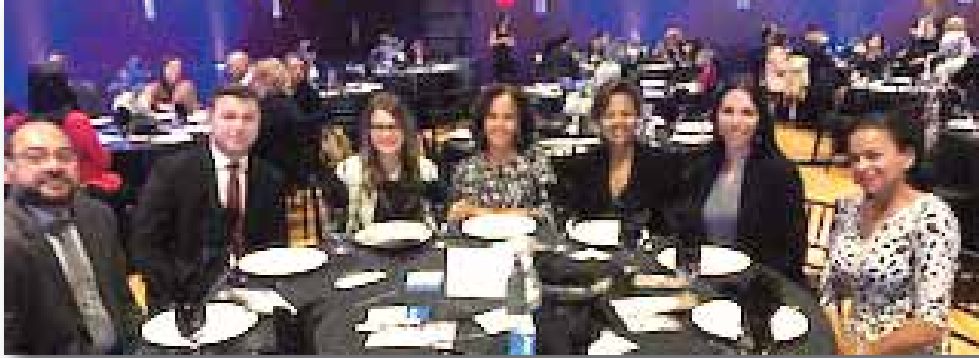
Staff attended the Arab- American Civil Rights League’s 7th Annual “Fight For Justice” Gala.

WCCCD served as a proud sponsor of the Detroit Public Schools Community District’s Fifth Annual Champions of Education event.