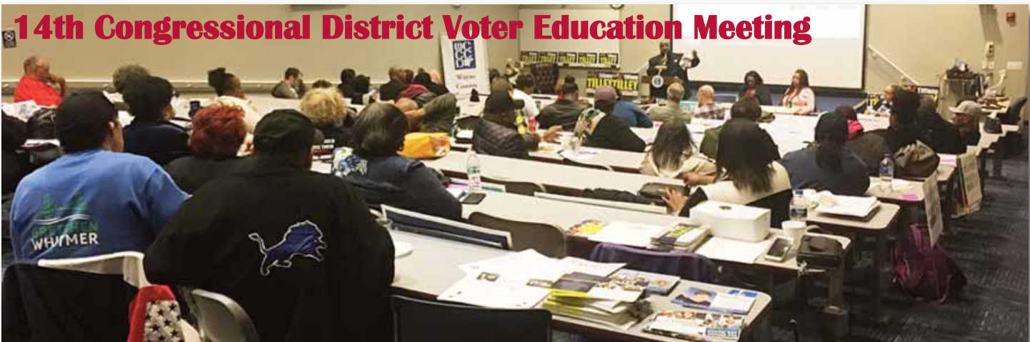
The 14th Congressional District held a voter's education meeting to provide information for voter's rights and involvement.