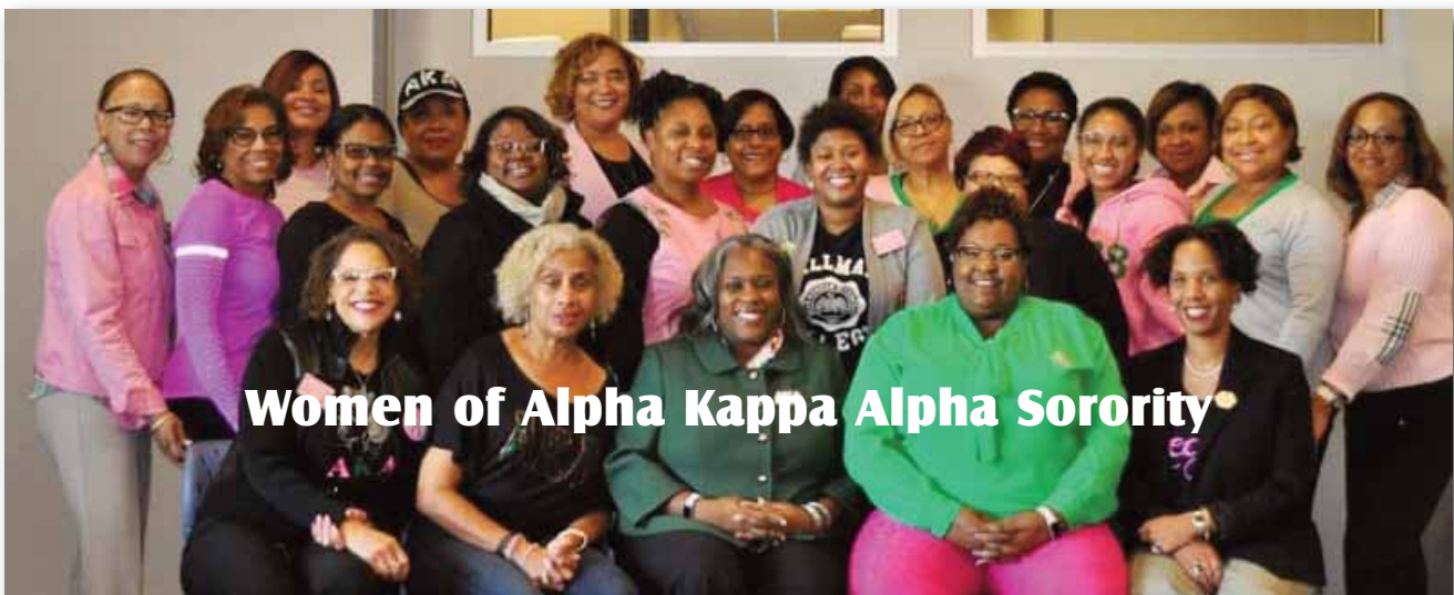
The Alpha Kappa Alpha Sorority held a workshop to introduce themselves to the community.