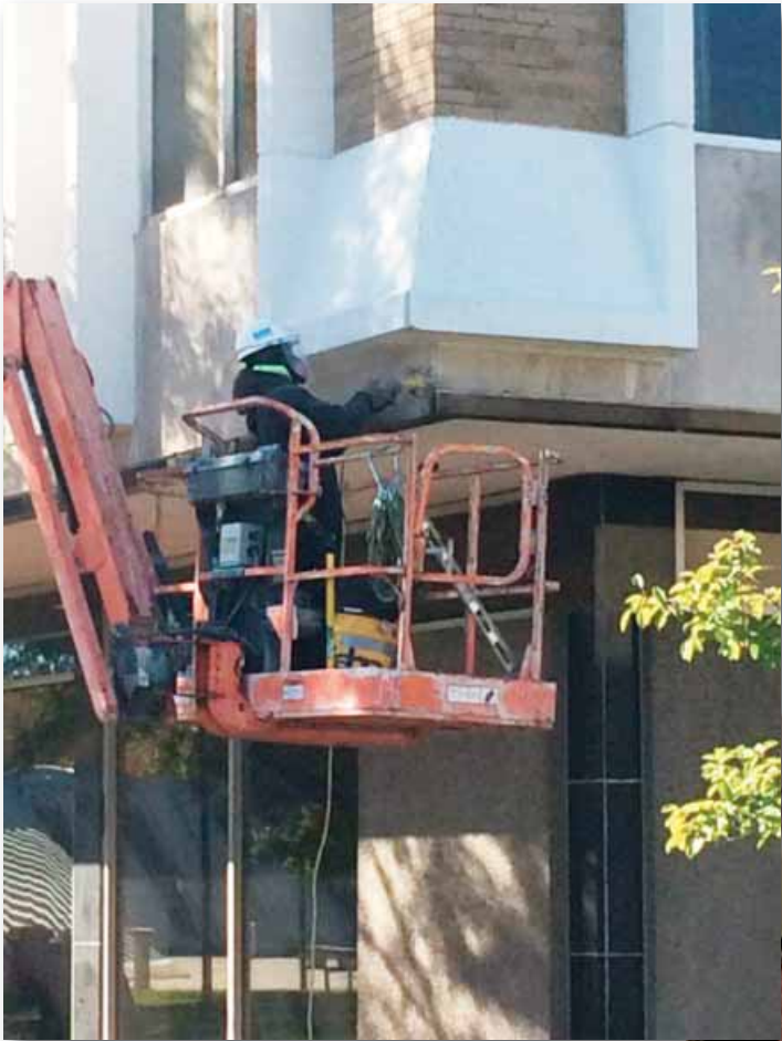
Northwest Campus Welcome Center Exterior Facade Repairs