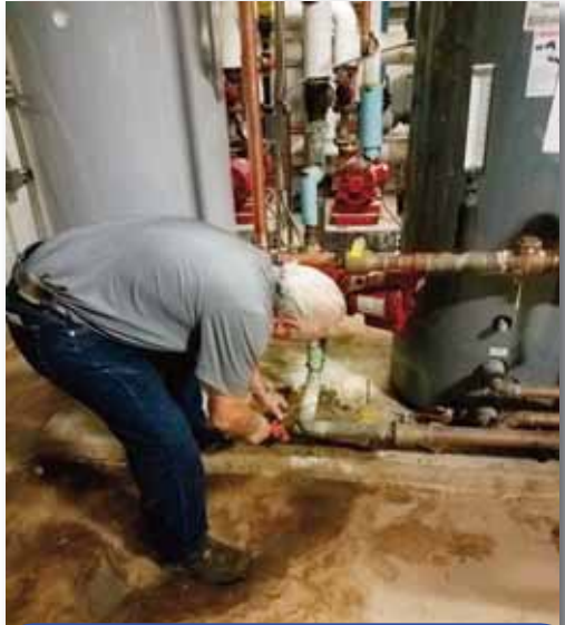
Downriver Campus Equipment Repair