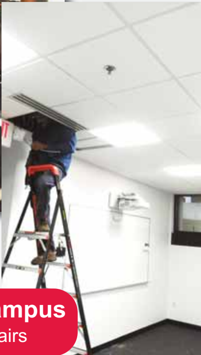
Downtown Campus Electrical Repairs