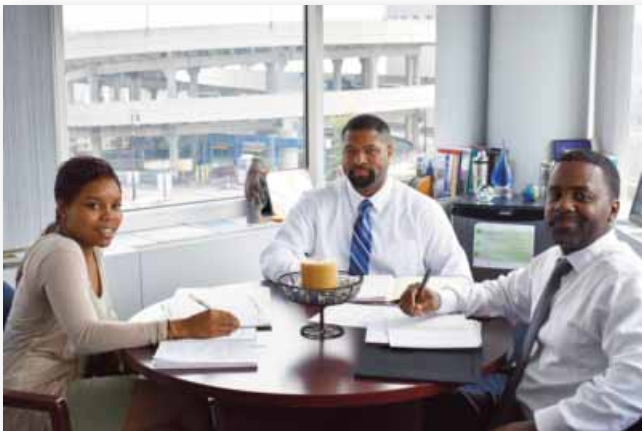
Staff from the Division of Student Services met with administrators from Harper Woods School District to discuss the opportunity to increase dual enrollment within their District.