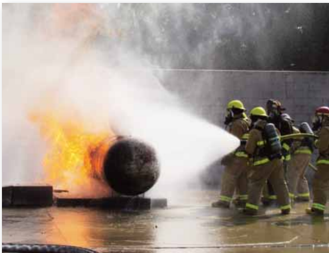
DTE Fire Brigade Training