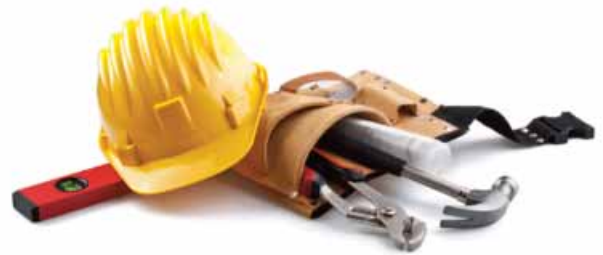
Downtown Campus Campus Electronics Classroom Renovation Project