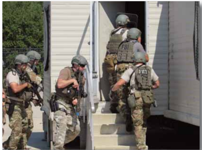
Federal Bureau of Investigation Training