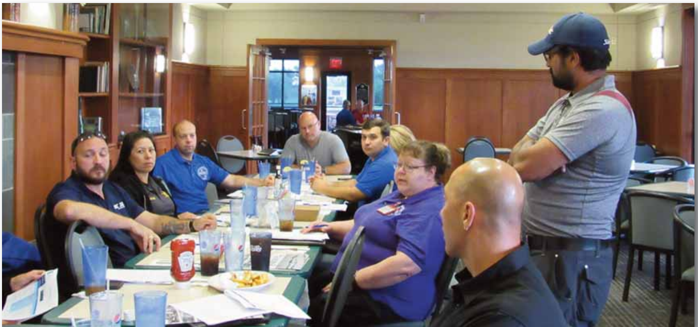
The Downriver Campus hosted the District's EMT Program Advisory Committee meeting