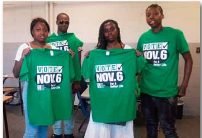
Our students at Little Rock Urban Institute are geared up and ready for a better life!