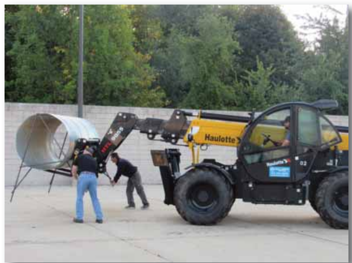
Canadian Pacific Rail Company Flammable Liquids Training