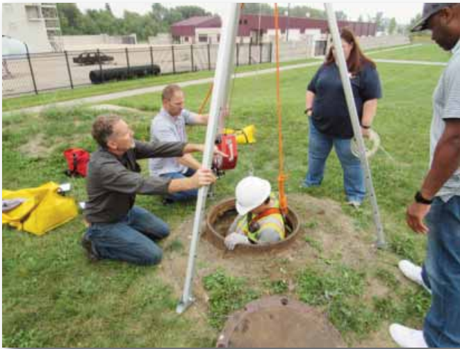
Eastern Michigan University Confined Space Training