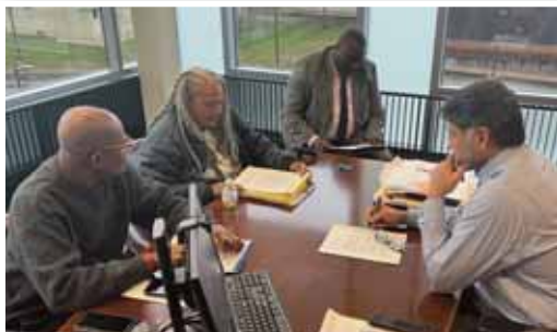
American Federation of Teachers Meeting