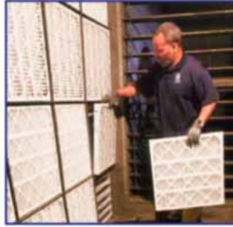
MECHANICAL SYSTEMS MAINTENANCE