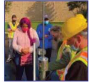
STUDENT APPRENTICESHIP/ INTERNSHIP PROGRAM