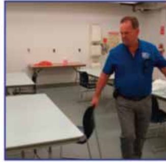
MANAGEMENT OF EXTERIOR AND INTERIOR ASSETS