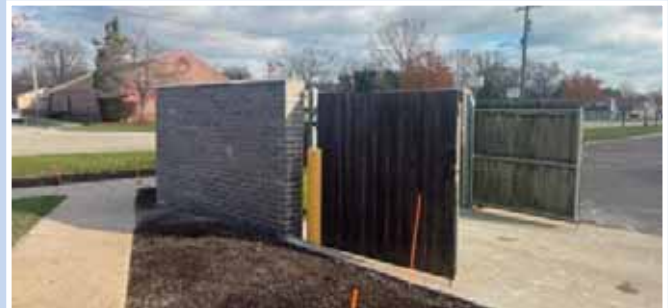
Completion of the Curtis L. Ivery Downtown Campus Dumpster Enclosure Rebuild