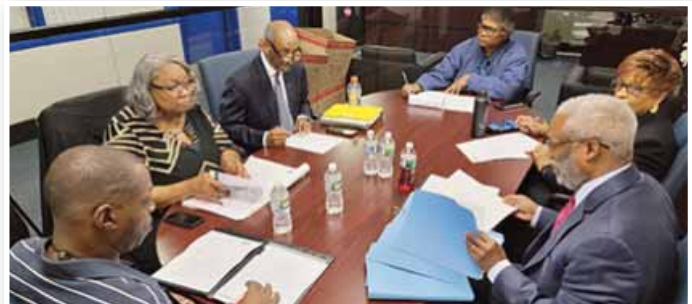
Monthly UAW Bargaining Meeting